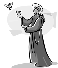
St. Francis of Assisi Patron Saint of Ecology October 4