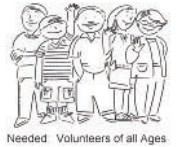
Needed: Volunteers of all Ages