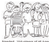
Needed: Volunteers of all Ages

A few months ago, our Human Concerns Committee completed a Volunteer Handbook and Application to help all of our parishioners learn about and become involved in the many ministries and activities of our parish. We are an active and faith-filled community, who reach out to those in need all year long. In keeping with our ONE HOUR PER MONTH theme, we invite you to pick up a yellow volunteer application from the kiosks on the tables in the gathering area. Fill it out and let us know what your preferences are, when you are available to help and contact information. We are updating our database, so that when a committee or ministry has a need for certain kinds of workers, we can simply hit a button and generate a list of people who wish to help. If you have any questions, please call the Parish Office.